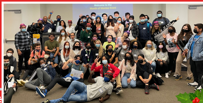
Top & Bottom: Fall 2021 PSG Events on NYC & LI campuses